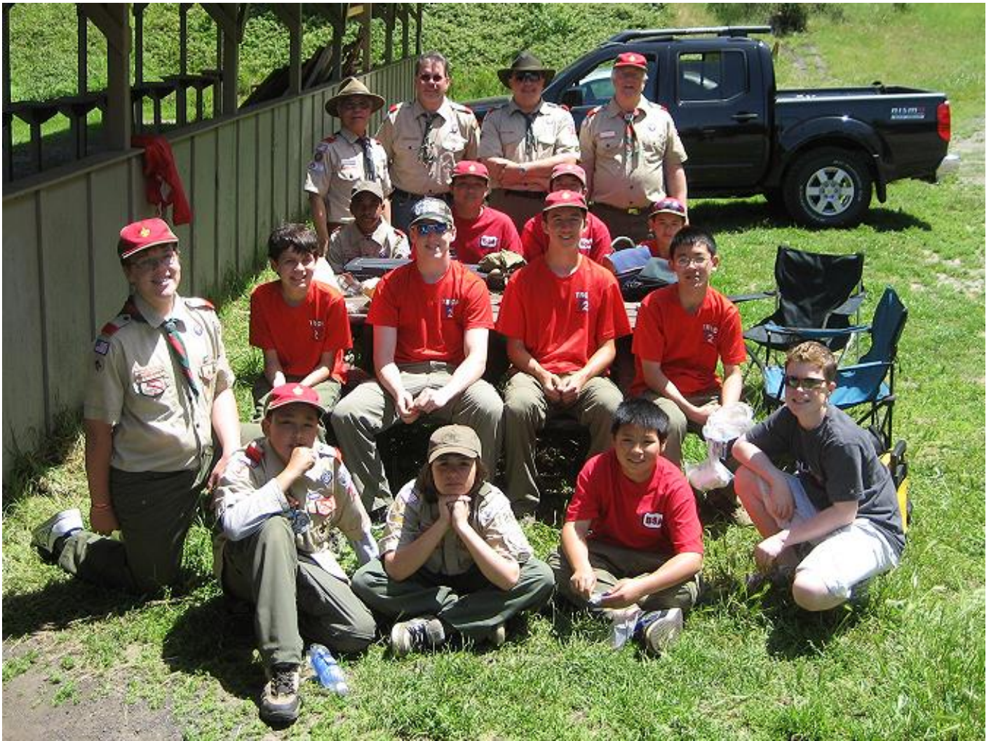
T726 Scouts at Chabot Gun Club