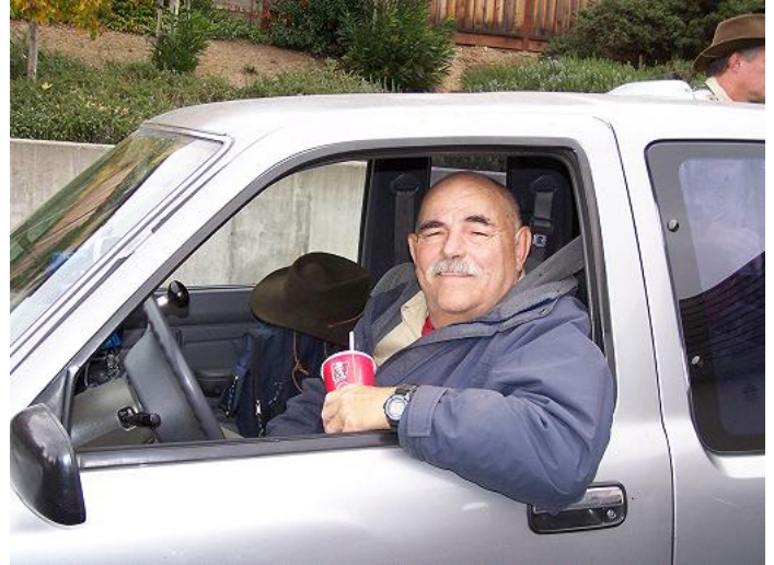
Packing up and getting ready to depart from Masonic Center