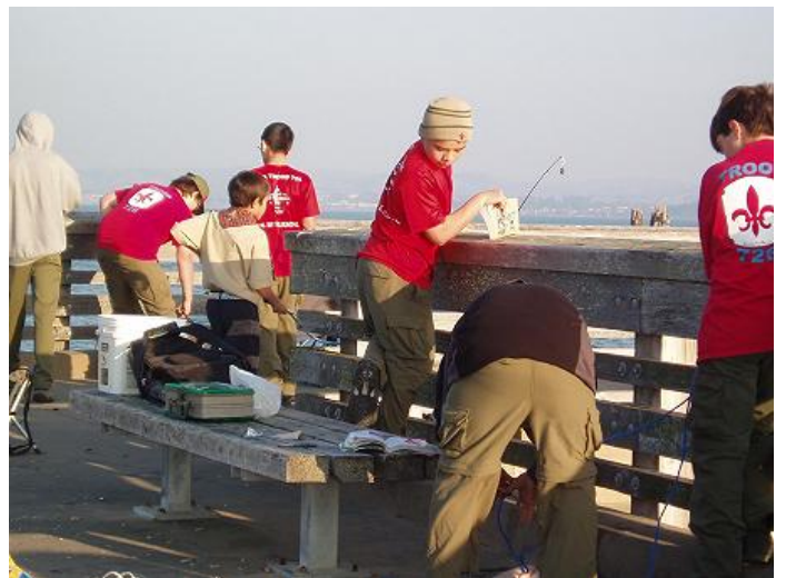
Crabbing and fishing at the pier, Point Pinole Regional Shoreline