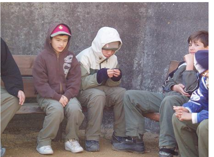
Brand new camp site at the Point Pinole Regional Shoreline